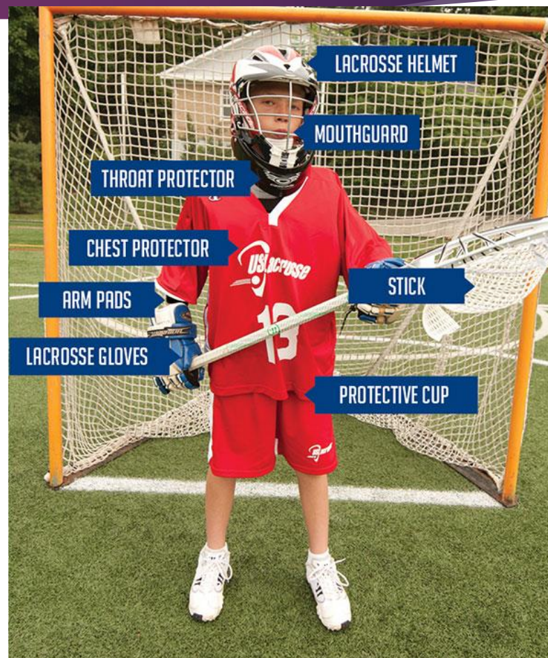
Goalie * All equipment provided by SYL